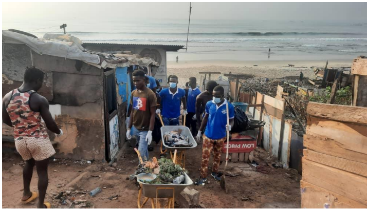
Sanitation Day in the Slum

KP organized a Sanitation Day in the slum behind the Art Center before Christmas. Staff encouraged and coordinated slum-dwellers to pick the trash, and organized a truck to depose of the waste. The exercise was a successful activity, and helped strengthen relationships between KP staff and the community.